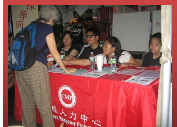
Summer Youth Employment Program Interns Serve Community Members at the CMP booth at the Asian Americans for Equality Fair.

在这个计划中，年轻人不仅认识到工作的真实意义，并且有机会获得就业指导，金融扫盲培训，学术和社交能力的进步。华埠人力中心明年仍然会继续开展这个计划。我们期待有更多的申请。