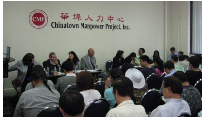
Panelists discuss the impact the economic stimulus is expected to have on small businesses.